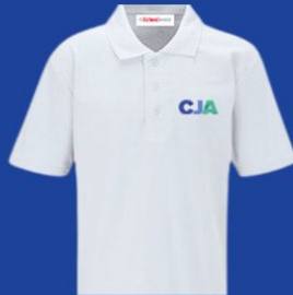
Short Sleeve Polo white