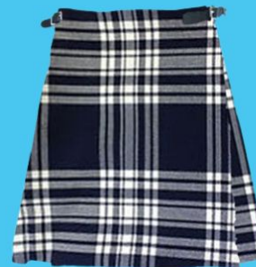
Tartan Kilt (only available through InSchool Wear)