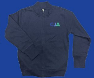
Navy Sweatshirt (full zip or 1/4 zip)

Tops for FORMAL UNIFORM must have CJA logo. Purchase through InSchool Wear