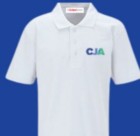
Short Sleeve Polo white