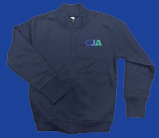
Navy Sweatshirt (full zip or 1/4 zip)

Tops for FORMAL UNIFORM must have CJA logo. Purchase through InSchool Wear