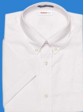
Oxford Shirt (short sleeve or long sleeve)

Tops for FORMAL UNIFORM must have CJA logo. Purchase through InSchool Wear