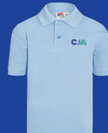
Short Sleeve Polo blue