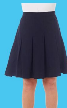
Navy skirt or skort