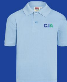
Short Sleeve Polo blue